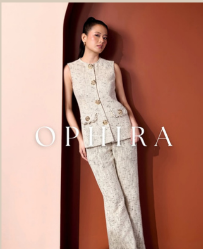
Veranobytanya Clothing Brand