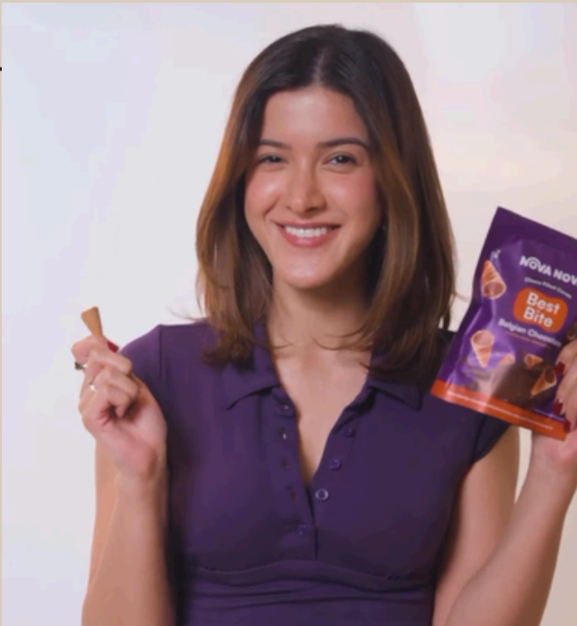
Shanaya Kapoor itsnovanova Ad Campaign