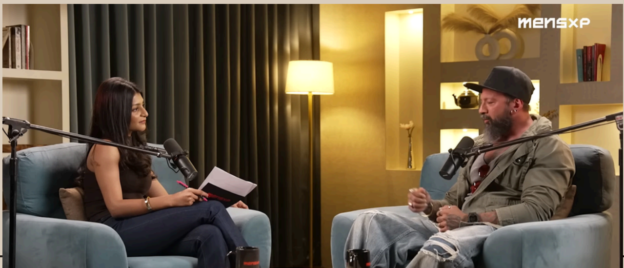
Shivohaam MensXP Podcast