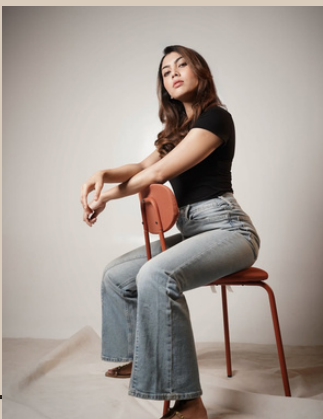
Pritthivi Saikia Portfolio Photoshoot