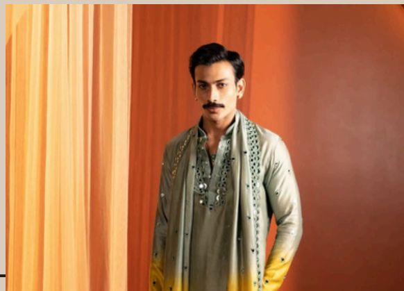
Kaaj Button Men's Clothing Brand