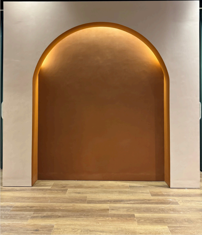
ARCH (LIGHT ON)