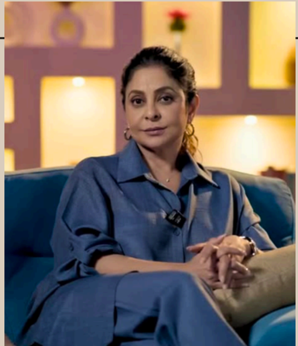
Shefali Shah PINKVILLA Interview